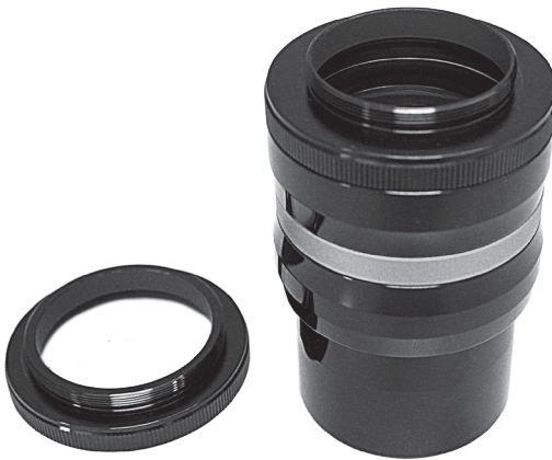
Figure 1. The Orion Field Flattener for EON 104mm ED-X2

This field flattener has an optimal backfocus distance of 55mm (distance from threaded attachment plate to camera sensor). It comes with interchangeable, thread-on adapter plates, one with 42mm (T-mount) male threads, the other with wider, 48mm male threads (which are equivalent to 2" filter threads).