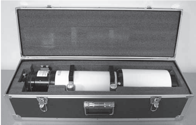
Figure 3 The foam-fitted hard case keeps the EON telescope clean and well-protected. (EON 115 shown)

Chromatic aberration literally means color distortion. Whenever light passes through one material to another, different wavelengths (color) are bent by different amounts. This is a prob-