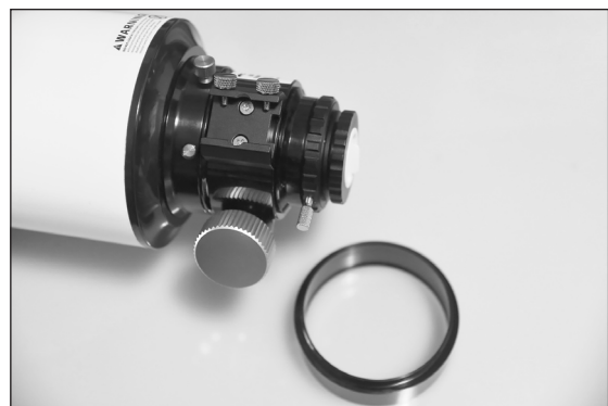
Figure 5. With the extension collar removed from the EON 130mm's focuser, thread the focuser back on the optical tube.