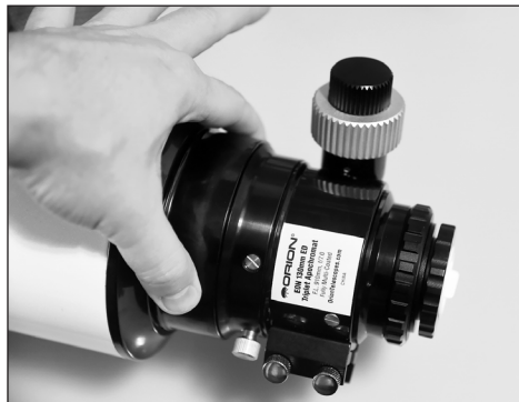
Figure 2. Remove the focuser of the EON 130mm by grasping the extension collar and turning it counterclockwise.