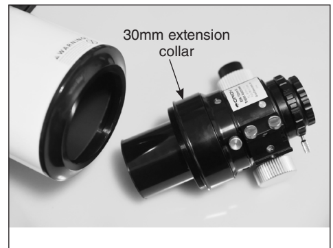
Figure 3. This shows the EON 130mm's focuser removed, including the 30mm extension collar.