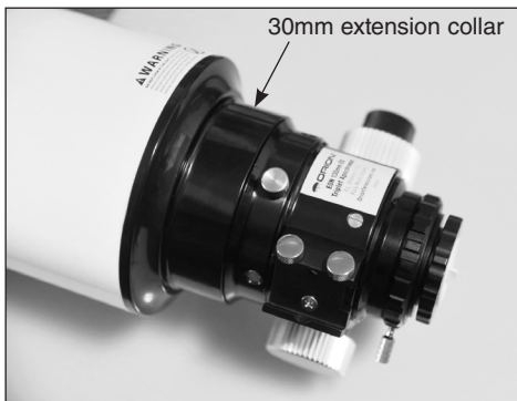
Figure 1. To achieve proper focus with the EON 130mm when using the 0.8x Reducer-Flattener, you should remove the 30mm extension collar.

The installation of the 0.8x Reducer-Flattener described below applies to both the EON 115mm and EON 130mm.