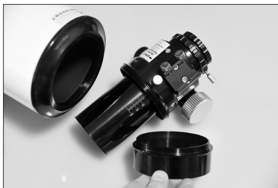
Figure 4. Unthread the extension collar from the focuser.